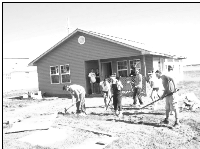
Villanova students hard at work outside Habitat House #37.