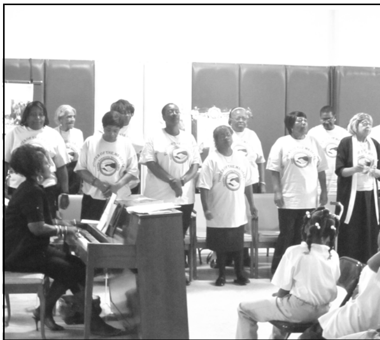
Staff and Seniors also showed off their talents at the Tutwiler Community Education Center Anniversary Celebration

Sunday we got in our two vans and headed back to Tutwiler. Since it was Mother's Day we stopped at a Cracker Barrel Restaurant to have a wonderful Mother's Day Dinner. One of the seniors said, “This is the best Mothers Day I have had. It is great to celebrate Mother's Day with all of your friends!”