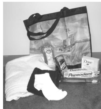
'Goodies' for goodie bags

You've helped us prepare some wonderful selections of personal products, maybe some socks, or even a towel and face cloth all fixed up in a tote bag you've shared with us! Folks love getting one of these.