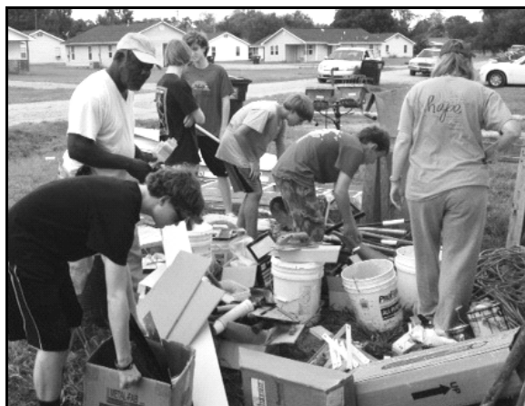
The Episcopal Habitat workers learn that cleaning up is part of the job!