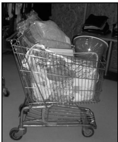
One of many baskets

An awesome experience to come home with socks, shoes, underwear, towels, p.j.'s, nightgowns, men's shirts, shorts and flip flops, bowls and household helps, baby items, school uniforms, slippers, kid's t's, shorts and hoodies etc. etc. etc.