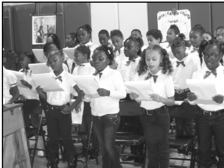
The children sing the happy songs of Christmas.