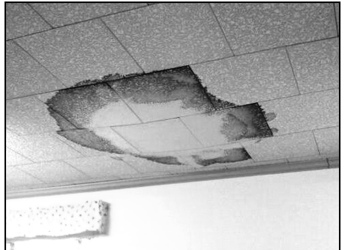
Leak in the office ceiling.

Weather has flipped and buried and drowned and played all kinds of tricks on all of us these past several months! Most recently we have LOTS of shingles that flew off the Clinic roof... A lovely leak above the fax in our office is almost dry enough to repaint, but the volunteer who “walked the roof” found weak boards (as we had feared) so a major fix-up is projected. At this time we don’t have a final bid, but we hope whoever fixes things doesn’t fry in the summer sun!