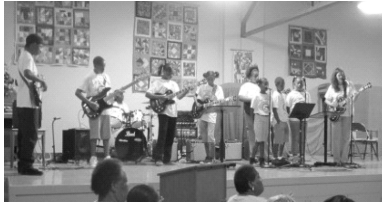
TCEC Student Blues Band