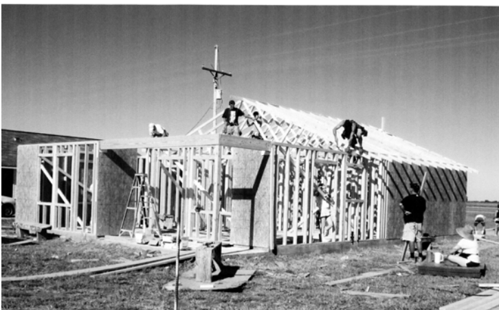
Another Habitat home under construction in Tutwiler.