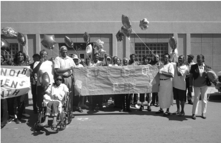
Never too old to play!