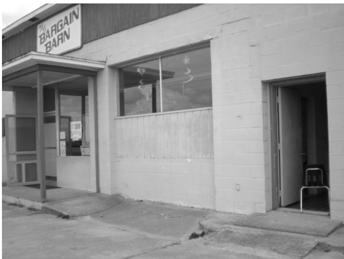
The "Doggie Door" at the Bargain Barn