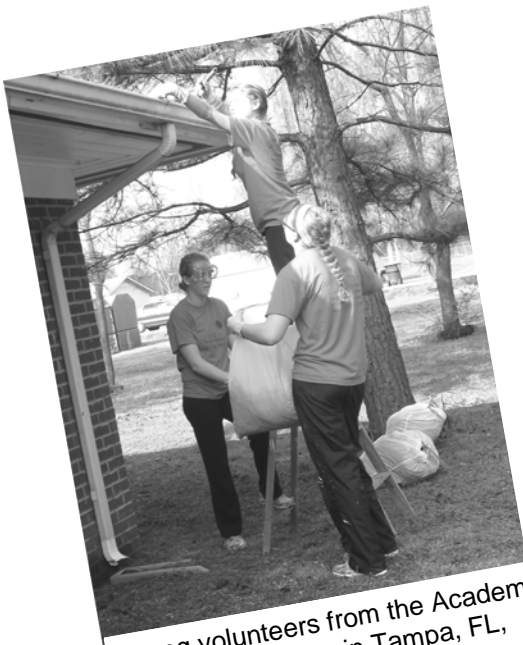
Young volunteers from the Academy of the Holy Names in Tampa, FL, cleaned gutters, washed windows and raked leaves at the Clinic and in Jonestown. Girls, here's proof for your mamas!