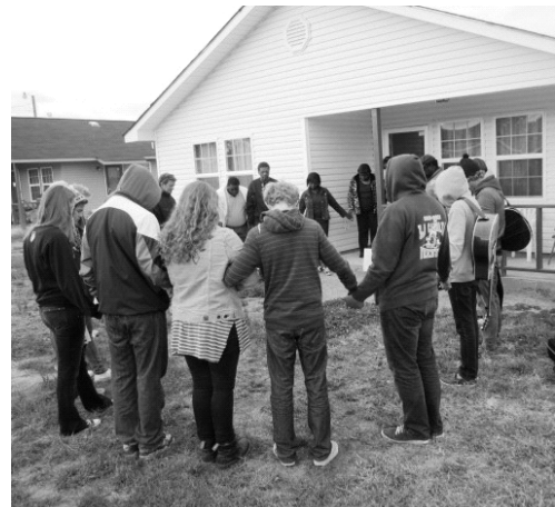
Bless this house.