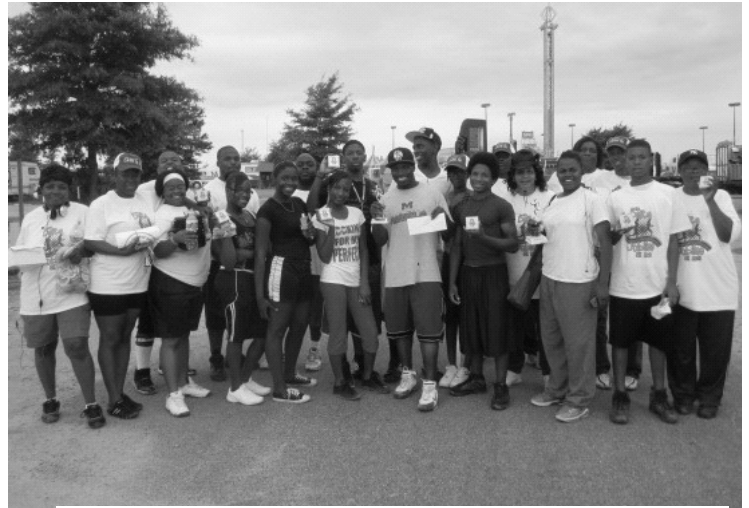
TCEC runners make healthy look like fun.

May was Senior Citizen Month. In order to celebrate, the TCEC staff planned a special program for the Wednesday Senior Program. They decided to have a parade. Any senior that wanted to walk did so, and those that could not, rode in a van or car. They went two blocks down the main street of town, turned the corner, walked up another street, past the Clinic and back to the Center. They did this while singing songs and giving up a few cheers. When they came back to the Center, they sat for a minute, had some water and then participated in the indoor activities. There were walking races in the gym, shooting basketball, shuffleboard or just sitting and watching. In the big room there were dominoes, cards, pool or just visiting friends. We ended the morning with a healthy luncheon. Several seniors said this was the best senior program we have had in a long time! I guess we better keep moving!