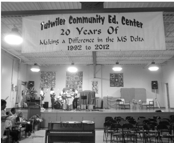
It REALLY HAS been 20 years!