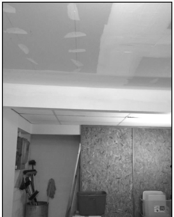
Ceiling repairs at the Bargain Barn made by the Sheil Center workers after-rain damage. (See 'Rain, rain...' page 2)