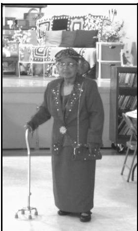
Senior Citizens brought their best "church clothes" and modeled them in a fashion show. Never too old to "strut your stuff!!"