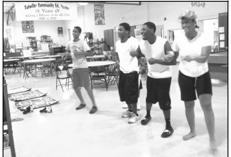
Thanks to some generous donations, TCEC was able to buy a "Wii." Teenagers love to do the dance programs. Good exercise and lots of fun.