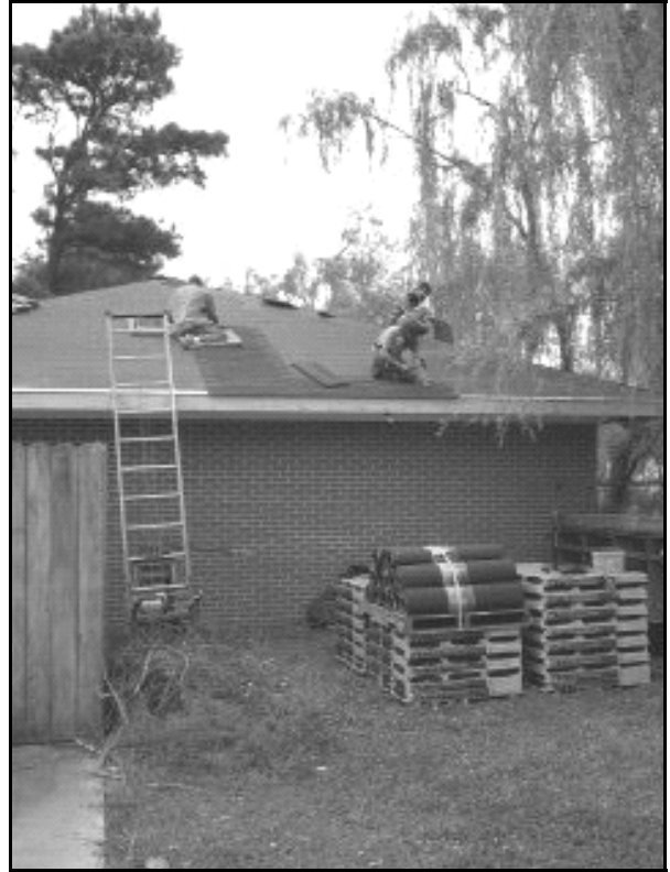
Much needed new roof for Tutwiler Clinic!