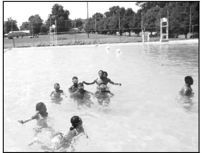
Swimming is a fun part of the TCEC Summer Program. We bring the children and teens to a pool in Clarksdale (15 miles away) three times a week. One of the field trips we take the children and teens on is to an Aquatic Center in Tunica about 40 miles away. Lots of other fun activities there.