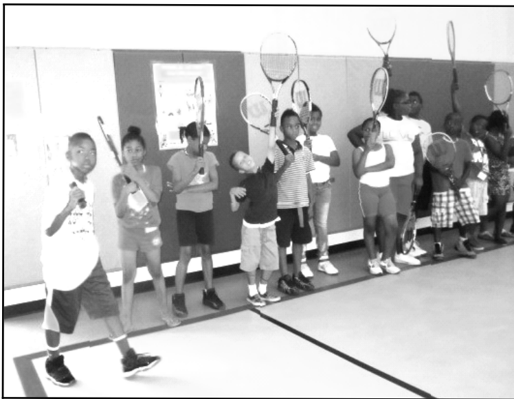
Tennis at TCEC! We were able to have a tennis teacher from Clarksdale come to the Center every afternoon for a week to teach the children tennis. They loved it! We are continuing playing in the gym at least once a week to give the children a place to practice. Just beginners, but a lot of potential!