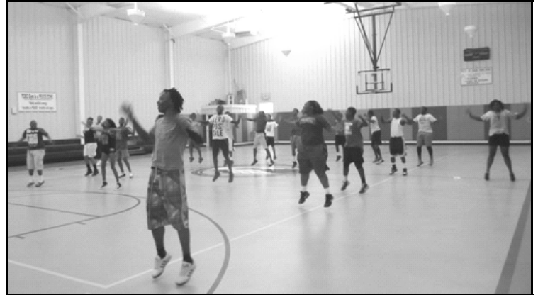
Teens enjoy doing some fast paced aerobics led by staff people from the Aaron Henry Clinic. TCEC is "partnering" with them as part of the TCEC Summer activities. Let's be fit and have fun at the same time.